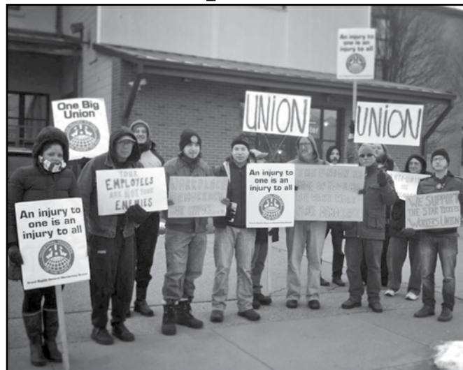
Star Ticket Workers rally in January.