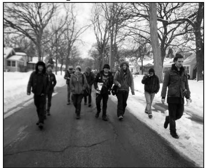
Sisters' Camelot workers "march on the collective" on Feb. 25.