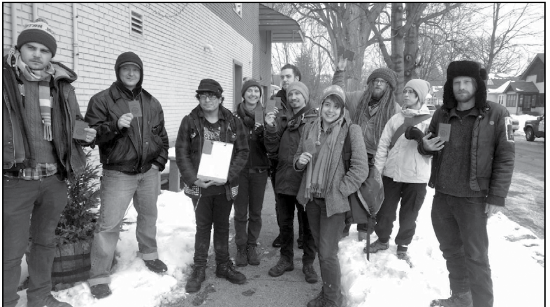
Sisters' Camelot workers show off their red cards after going public as IWW members on Feb. 25.