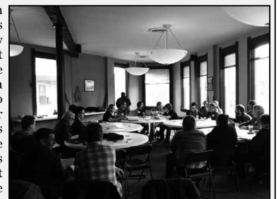
February GMB meeting.

shouldn't be as much of a problem now because we have 10 delegates throughout the state to sign up new members and meet people. We dealt with it in the past by making the Facebook page, creating an Indiana IWW email list, and driving out to meet people face-to-face in their town or city. Another problem has been how to connect with people who are not on Facebook. This was solved by using email to contact those people, by making phone number contact lists, and continuously meeting with and talking to members and workers. Of course another issue is that people generally do not know that an IWW branch exists or is actively organizing within the state. To get the word out about our branch we have done as much as possible, by handing out flyers, putting up posters, using "silent agitators," connecting with people on Facebook and Twitter, talking to any and all workers that we can, holding call-out meetings in different locales and other such outreach efforts. There have been other minor troubles of course; coordinating things, trying to get in contact with people, waiting on things, and the dreaded paperwork. But the problems have been nothing compared to the satisfaction of overcoming them. Travel-