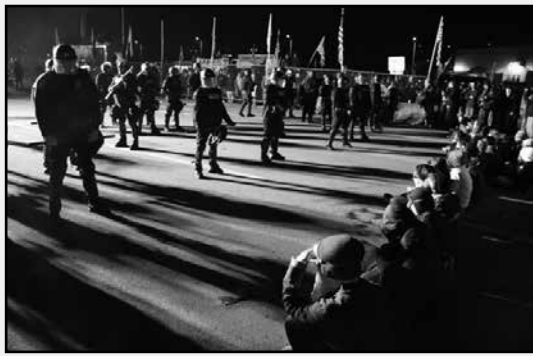
Police & protestors face off at the Port of Olympia in 2007.