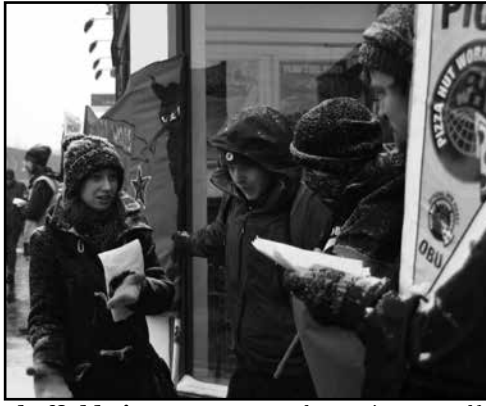
Sheffield Pizza Hut, 2012.

The plan was to organize a walk-out on the next Bank Holiday, which would have been on the day of the illustrious royal wedding (a nice note of celebration if you ask me). However, the plan fell apart when an unpopular loud mouth thought