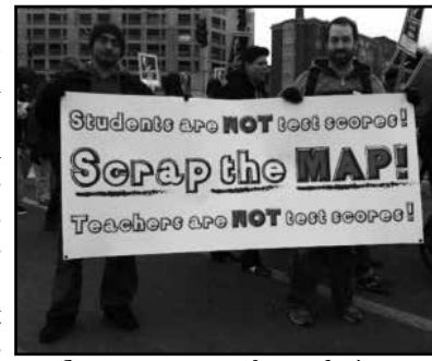
Students protest in Seattle.

Other groups of teachers and students began to boycott high stakes tests. In Massachusetts a coalition of 130 professors and researchers, including many from Harvard, Tufts, Boston and Brandeis Universities called for a boycott of the tests. The research committee had condemned their state reliance on tests, citing a nine-year study which concluded that high stakes testing did not improve education results. In Providence, R.I., the Providence Student Union condemned use of another high stakes test, the New England Common Assessment Program (NECAP). Providence High School students staged a demonstration on Feb.