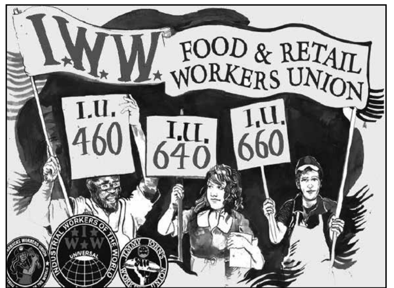
Logo for Food and Retail Workers United.

In conclusion, the grocery store campaign, despite its flaws, was in a sense incredibly successful. The IWW doesn't just organize shops, it organizes people and it builds up workers into radical militant unionists. The grocery store campaign created a space in the Twin Cities GMB for that to occur. It also taught us valuable lessons about what not to do in an organizing campaign. Through our mistakes, we have become better organizers and we now have the opportunity to share those lessons with others in the union, as well as to bring our skills to new union projects. In the aftermath of the grocery store campaign, we are now equipped to build the union in a more purposeful and organized way.