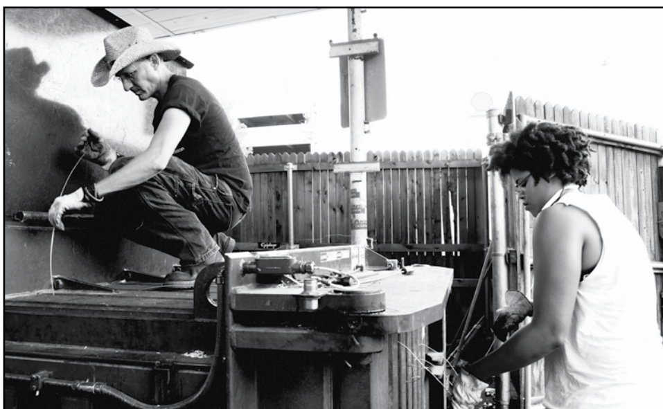
Ecology Action workers using a baler (compactor).

Don’t give in! Don’t give up! Resist, Rebel, Create and Build!