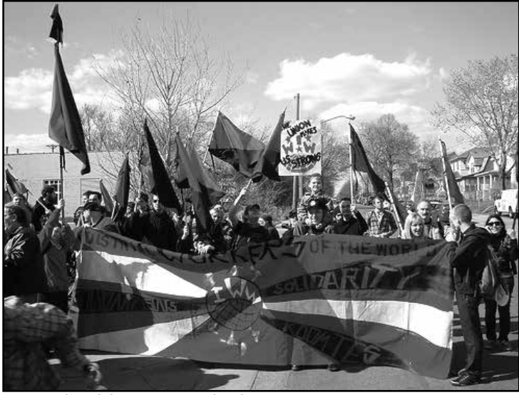
The Twin Cities GMB rallies in 2010.