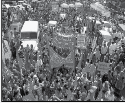
The general strike.

In what is most likely the largest strike in human history, 100 million workers went on strike in India on Feb. 20-21. They were opposing price hikes on commodities such as diesel, gas and electricity, as well as day-to-day goods. The strike