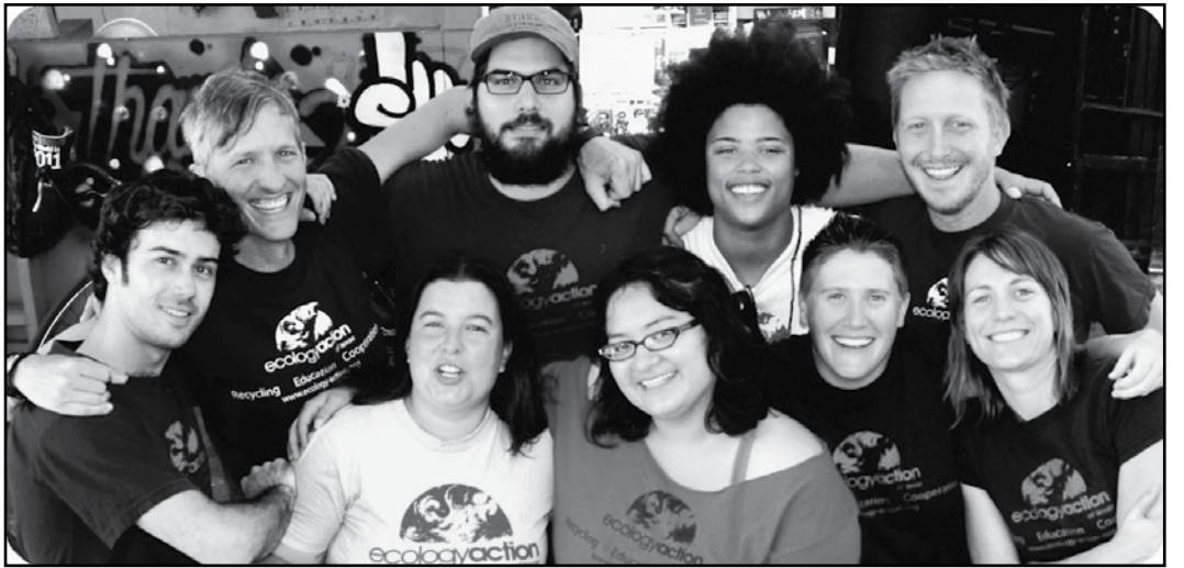
An Ecology Action barrel (left) and a group shot of the workers (right), part of the oldest worker cooperative in Texas.