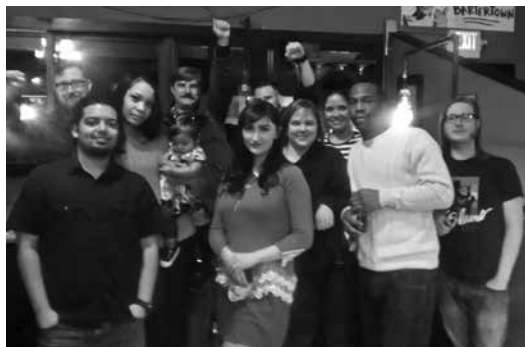
Call center workers celebrate.