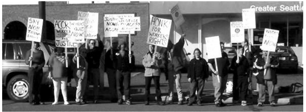
Seattle ACORN workers and supporters picket for union recognition on February 27, 2001.